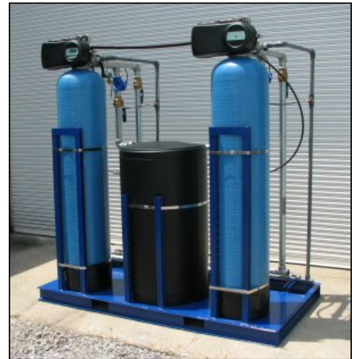
RF-100-TA with Optional Skid Mounting

Control Valve Specifications. The main control valve(s) shall be the Task Master III™ with electronic controller to actuate the cycles of backwash, brine, slow rinse, fast rinse, and service for a water softener (or backwash, rinse and service for a filter). The control valve(s) shall be Task Master III™ 5-Cycle, multi-port control valve(s) with machined passivated CF8M Type 316 Stainless Steel body, Type 316 Stainless Steel piston assembly, and EPDM (NSF61 and WRAS Approved) inserts and seals with electronic controller and drive motor assembly in a NEMA 4/IP65 Style Enclosure. The valve shall operate with a single motor driven piston positioned by optical sensors. Valve inlet and outlet shall be 1 ½" FNPT. Backwash drain shall be ¾" or 1 ½" depending on flow. The brine inlet shall be ½". The one-piece brine eductor shall be installed in the valve. The valve shall be equipped with threaded ¼" FNPT ports for the installation of sample taps and pressure gauges. (Taps and gauges are optional.) Hard water by-pass shall be available during all regeneration cycles at 70 gpm or at the peak flow rate of the unit, at a pressure drop less than 25 psi, whichever is less. No hard water bypass option is obtained by adding a shut off kit to the valve. The valve shall be of a single piston design and shall not use multiple plungers or diaphragm valves. Maximum rated power shall be 125 watts with available current options of 115 VAC, 230 VAC, 100 VAC, 200 VAC, in 50 or 60 Hertz.