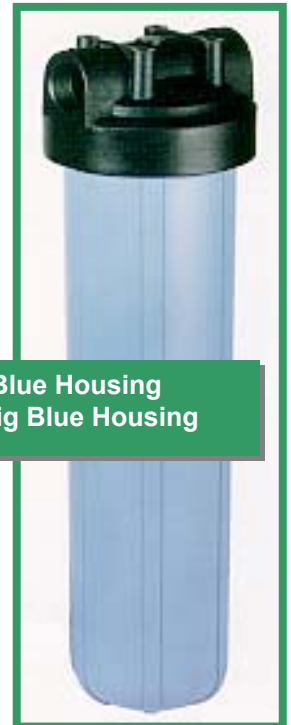
820233 1"NPT 20" Big Blue Housing 820233 1 1/2" NPT 20" Big Blue Housing